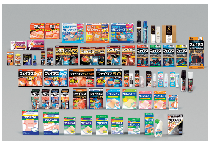
Over the Counter Products