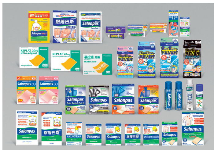
Products for Oversea Markets